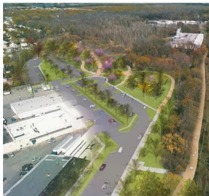
Concept design of new addition to Peter J. Barnes III Wildlife Preserve