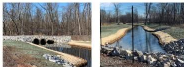
Environmental remediation of the property nearing completion