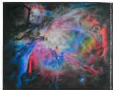
Orion Nebula by Maja Opacic

The current show features oil paintings by Maja Opacic, inspired by images from NASA and the Hubble Space Telescope. Majestic scenarios that spark a sense of wonder. Show runs through November.