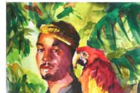
Seeing Eye to Eye by Sandy Mezinis

Animals, Wild and Winsome is a group exhibit featuring 27 works by 19 artists offering a glimpse into the souls of the many creatures that share our earthly home. You will see paintings, photographs, linocut print, textile art, sculpture and collage. The exhibit is on view until December 30: M-F 10-1, Sun. 9-1 and by appointment.