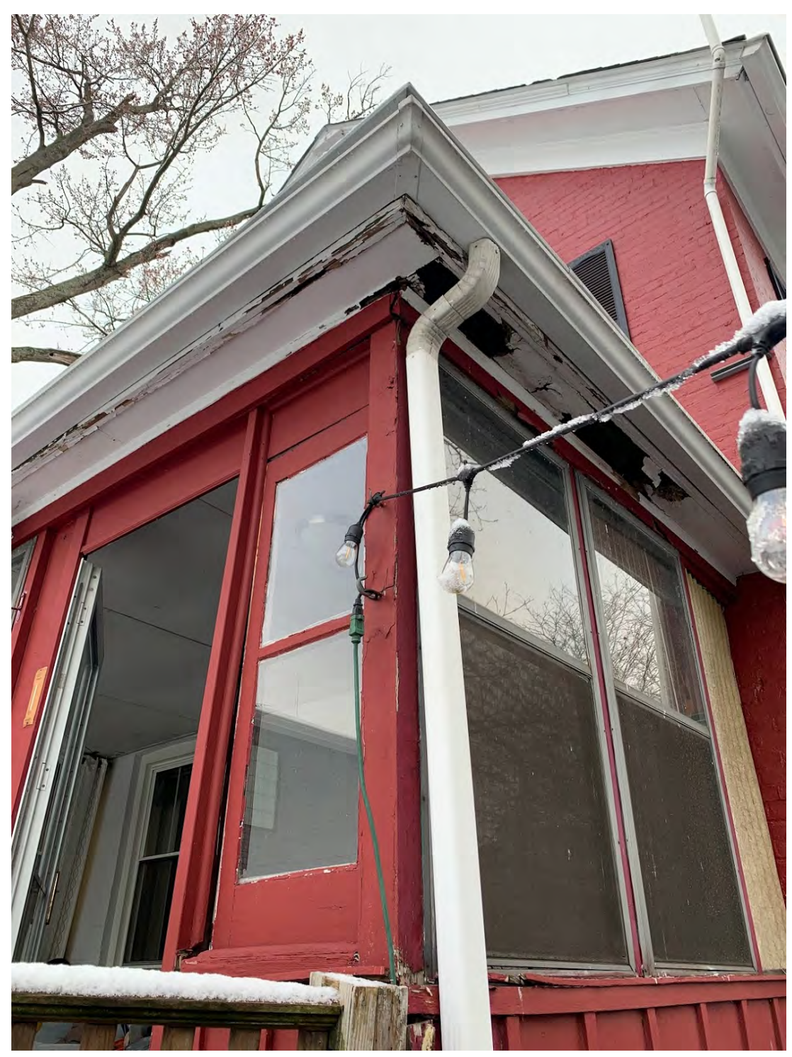
Evidence of porch deterioration