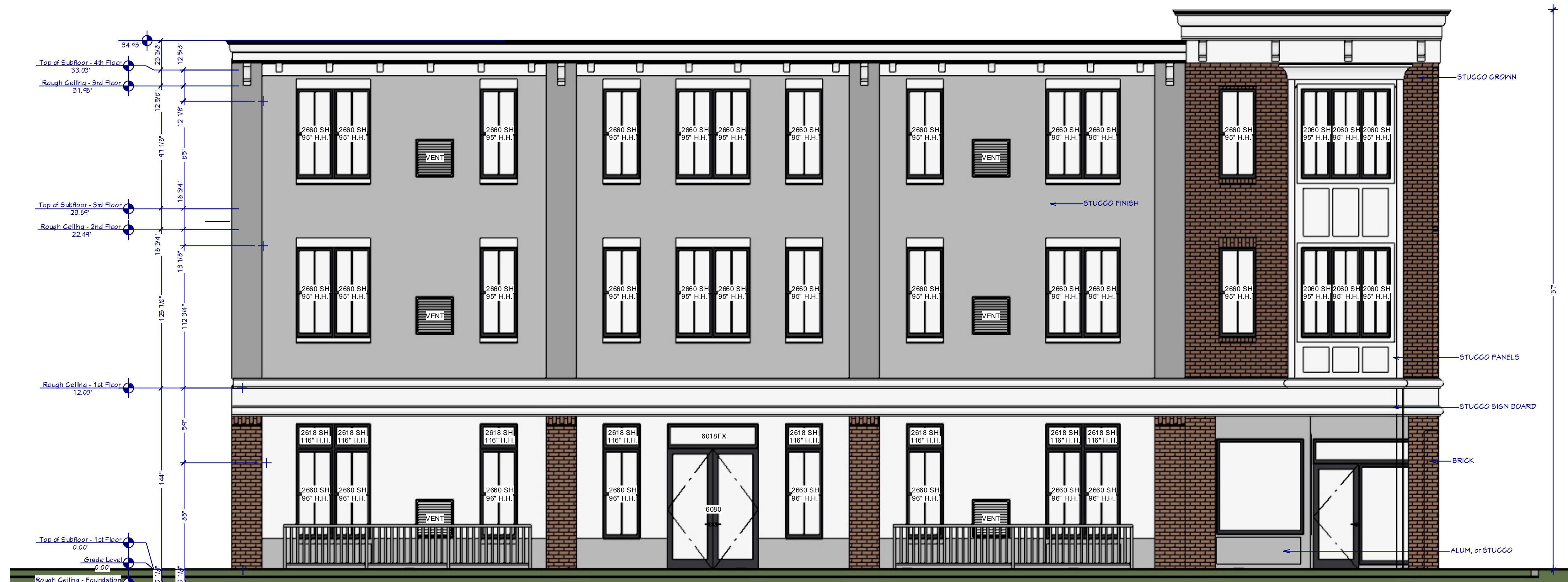
FRONT ELEVATION 1/4 in = 1 ft