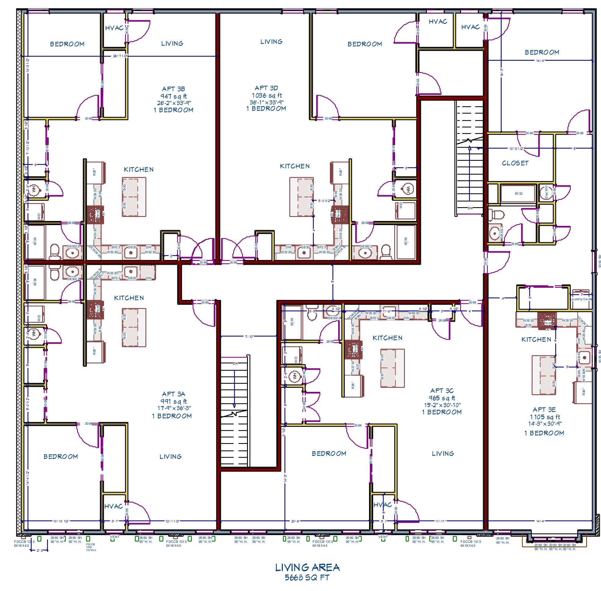
3rd Floor 1/8 in = 1 ft

© COPYRIGHT NOTE 1. No part of this drawing shall be reproduced, stored in a retrieval system, or transmitted in any form or by any means, electronic, mechanical, photocopying, recording, or by any information storage and retrieval system, without the prior written consent of the architect. 2. These drawings are the property of the architect and shall remain the property of the architect. No part of these drawings shall be used for any other project or purpose without the prior written consent of the architect. 3. The architect shall not be responsible for any errors or omissions in these drawings, or for any consequences arising from their use, unless it is shown that the architect was negligent in the preparation of these drawings.