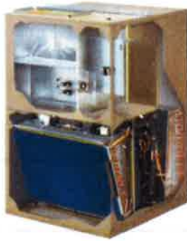
Vintage-Series (EWC4): Electric Heating/Electric Cooling Magic-Pak's [1 - 2.5 tons] (26,000 - 64,000 MBH)

Download Armstrong Air Magic-Pak Vintage-Series Literature