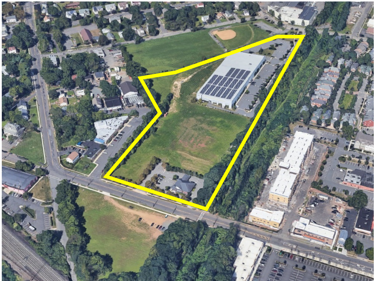
Bird's eye view of the Project Area, looking northwest, outlined in yellow. The Project Area is bounded by Middlesex Avenue with Trailhead Park beyond (bottom), Future Middlesex Greenway Extension (right) and Vidas Park (top).

Originally part of a larger industrial superblock containing the Oakite factory that manufactured asbestos building materials, the Project Area is generally bounded by Vidas Park to the west, Durham Avenue to the north, the Lehigh Valley Railroad Line right-of-way (“future Middlesex Greenway Extension”) to the northeast, Middlesex Avenue to the southeast, and Factory Street to the southwest. Since closure of the Oakite factory in the 1980’s, Vidas Park & Trailhead Park, Fulton Bank, and the Metuchen Sportsplex have been developed out of the former Oakite industrial site while the remainder of Project Area has remained vacant, unimproved land.