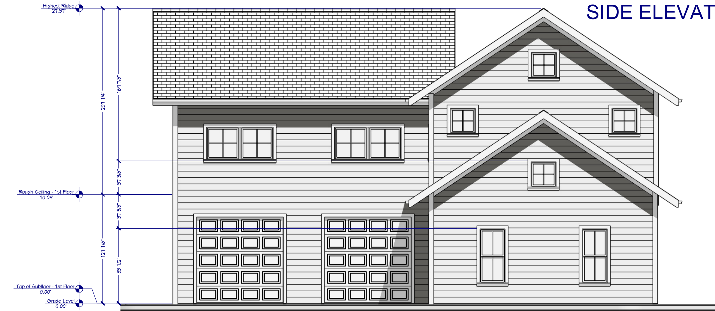
FRONT ELEVATION 3/16 in = 1 ft