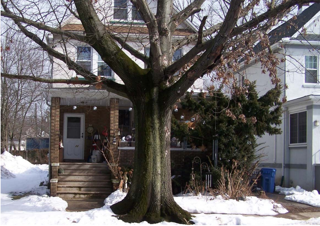
22 HALSEY STREET