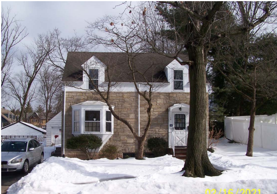
14 HALSEY STREET