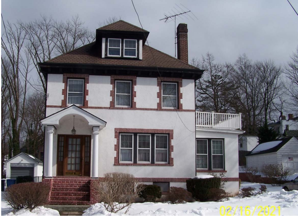
16 HALSEY STREET