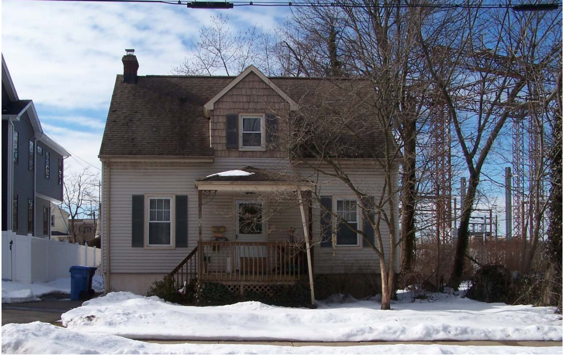
25 HALSEY STREET