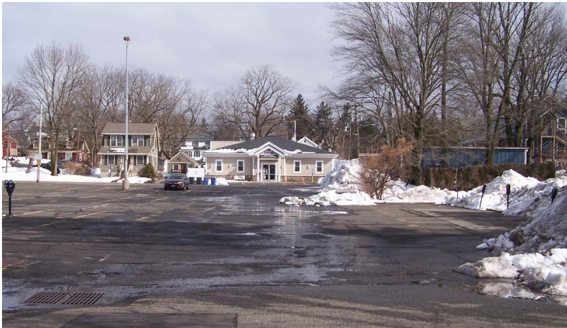
PARKING LOT ACROSS STREET