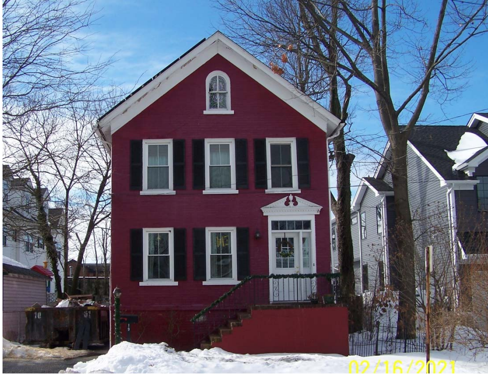
19 HALSEY STREET