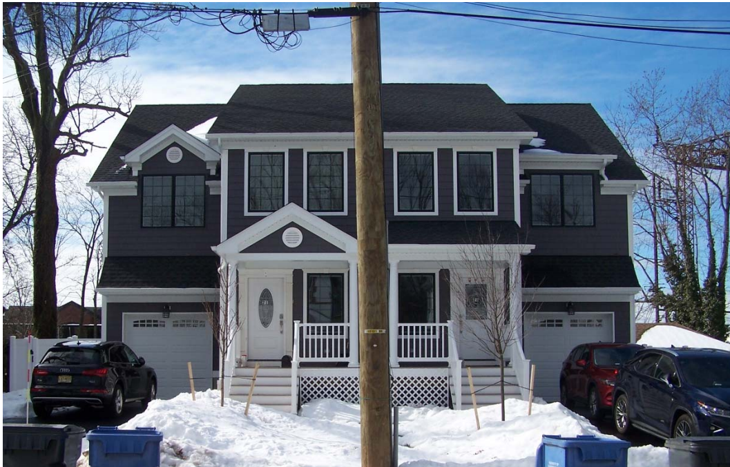
21-23 HALSEY STREET