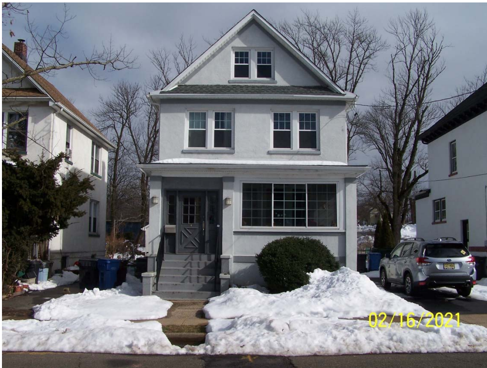
20 HALSEY STREET