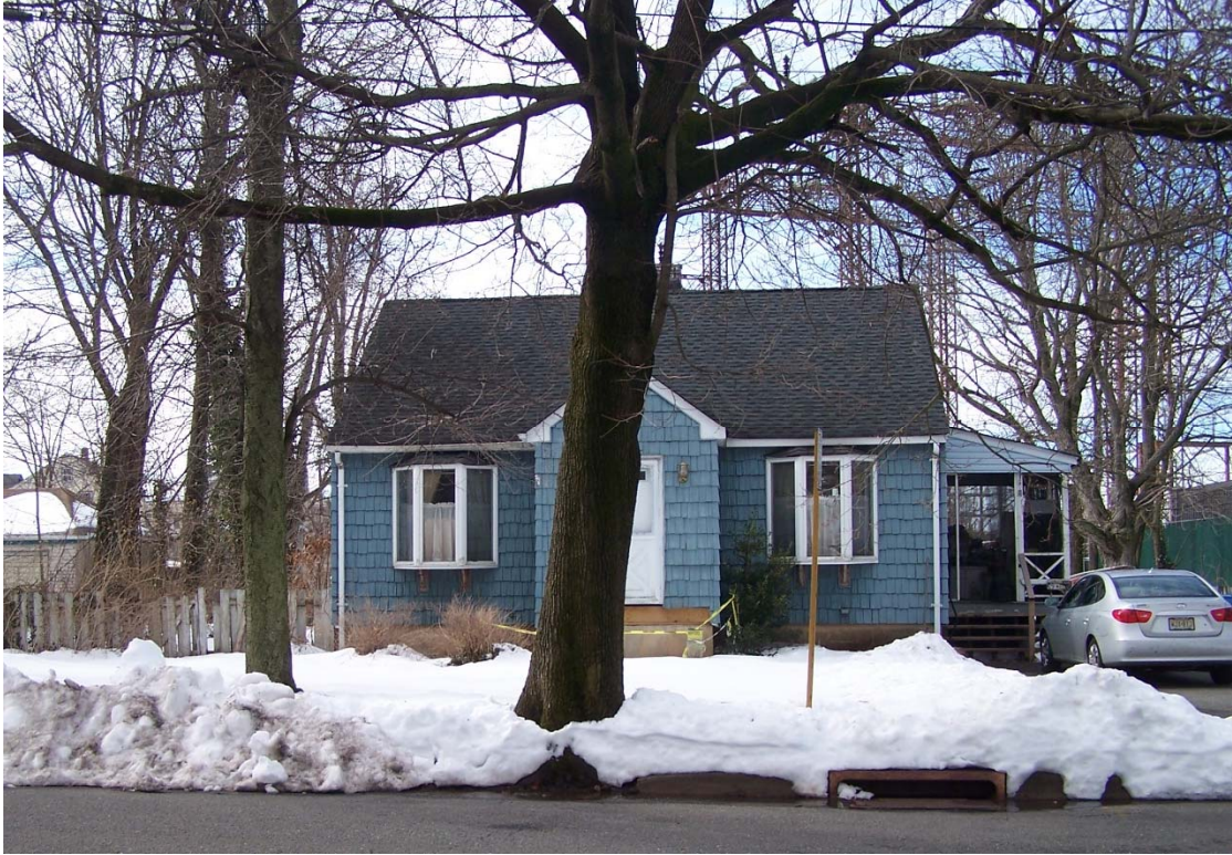
29 HALSEY STREET