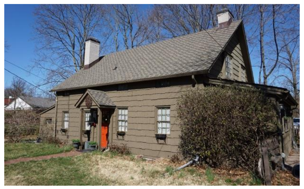
Photograph 9. Ayers-Allen House at 16 Durham Avenue