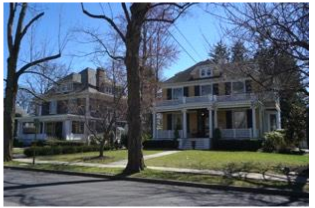
Photograph 19. Examples of Colonial Revival style

The twentieth century also saw the introduction of mail order houses, with the Sears, Roebuck and Company offering over 400 different models of ready-to-assemble houses. There are numerous houses in Metuchen, such as the bungalow at 230 Woodbridge Avenue, that appear to have been mail order houses, although more research would be needed to determine exactly how many examples there are in the Borough.