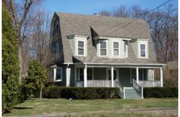
Photograph 20. Example of Dutch Colonial Revival style