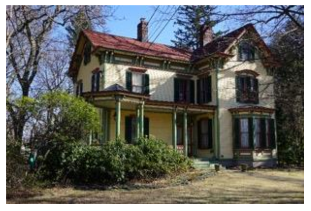
Photograph 15. Example of Italianate L-Plan style