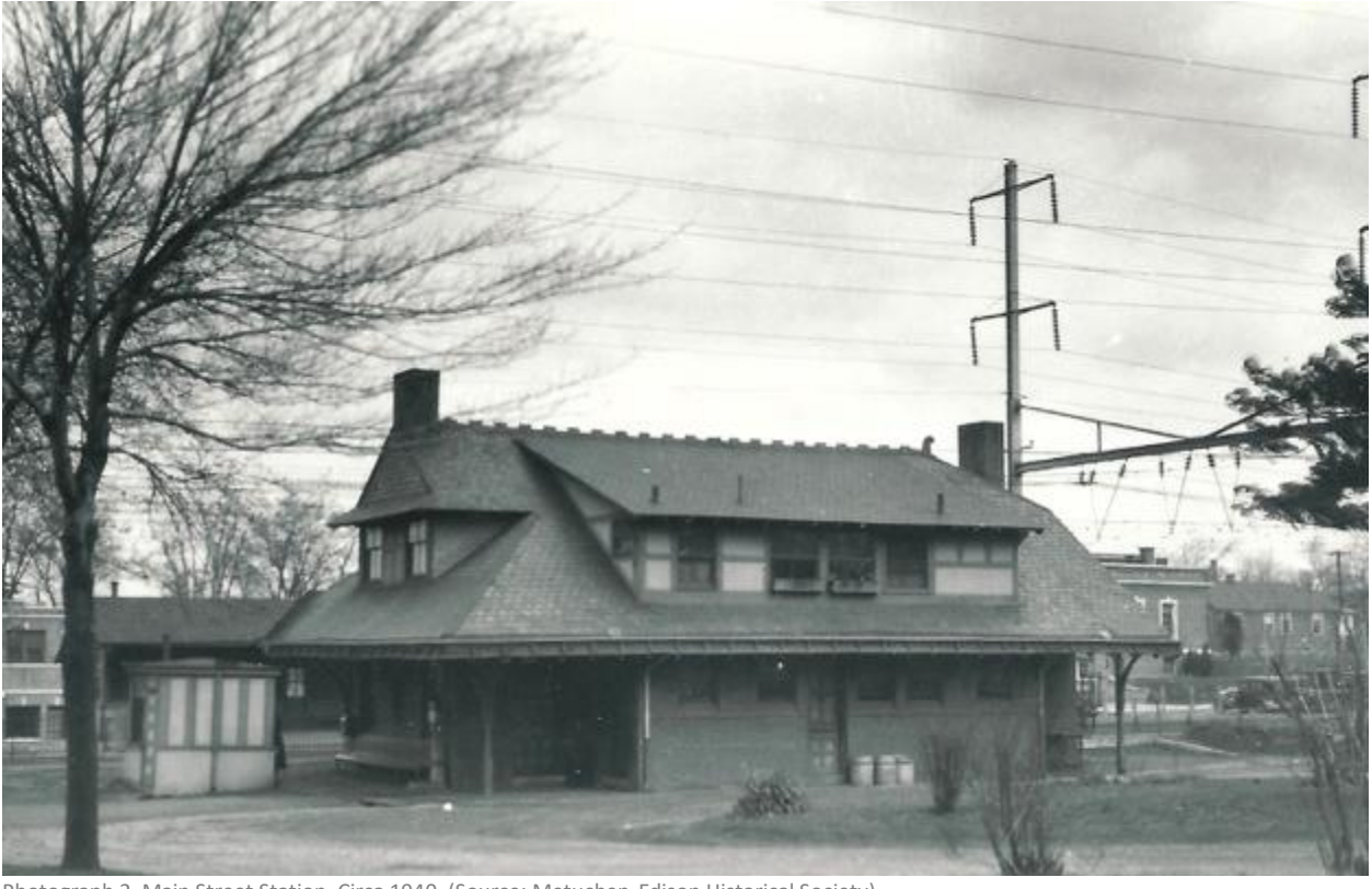
Photograph 2. Main Street Station. Circa 1940.

The New Jersey Railroad constructed a station at Lake Avenue in 1841, which served as the primary station until its replacement in 1888 by the current station on Main Street. Another stop, the Robinvale Station, named for another prominent landowner, the Robins family, was located at the end of Dark Lane, now Grove Avenue. These stations served as Metuchen's portals to the region's growing cities, and slowly but surely Metuchen's identity was drawn into the corridor of communities and economies linked together by the railroad. In 1867, the New Jersey Railroad was leased to the Pennsylvania Railroad ("PRR"), which began operating the Philadelphia to New York City route, now known as the Northeast Corridor.