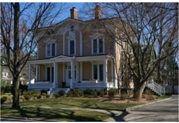
Photograph 14. Example of Italianate style