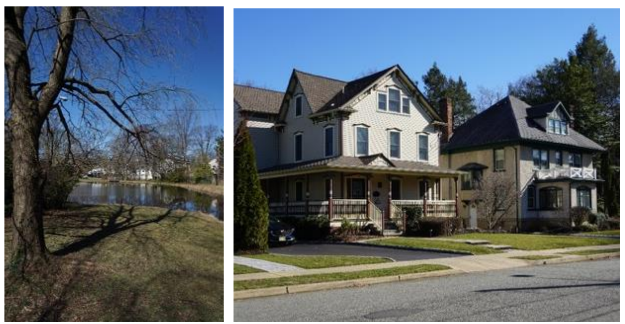
Photographs 34-35. Representative imagery of Tommy's Pond / Lake Avenue / Rose Street neighborhood

The Borough's southwest quadrant, identified as Neighborhood 5 in 1956, contains "some of the older estates" along Lake Avenue, Graham Avenue, High Street, Graham Avenue, Rose Street; and twentieth-century bungalows, Jefferson Park; and YMCA. This neighborhood encompasses many individual buildings identified in the 1975 and 1979/1985 surveys, portions of the historic districts identified in the 1979/1985 and 1990 surveys, and historic district recommendations in the 2010 and 2017 studies.