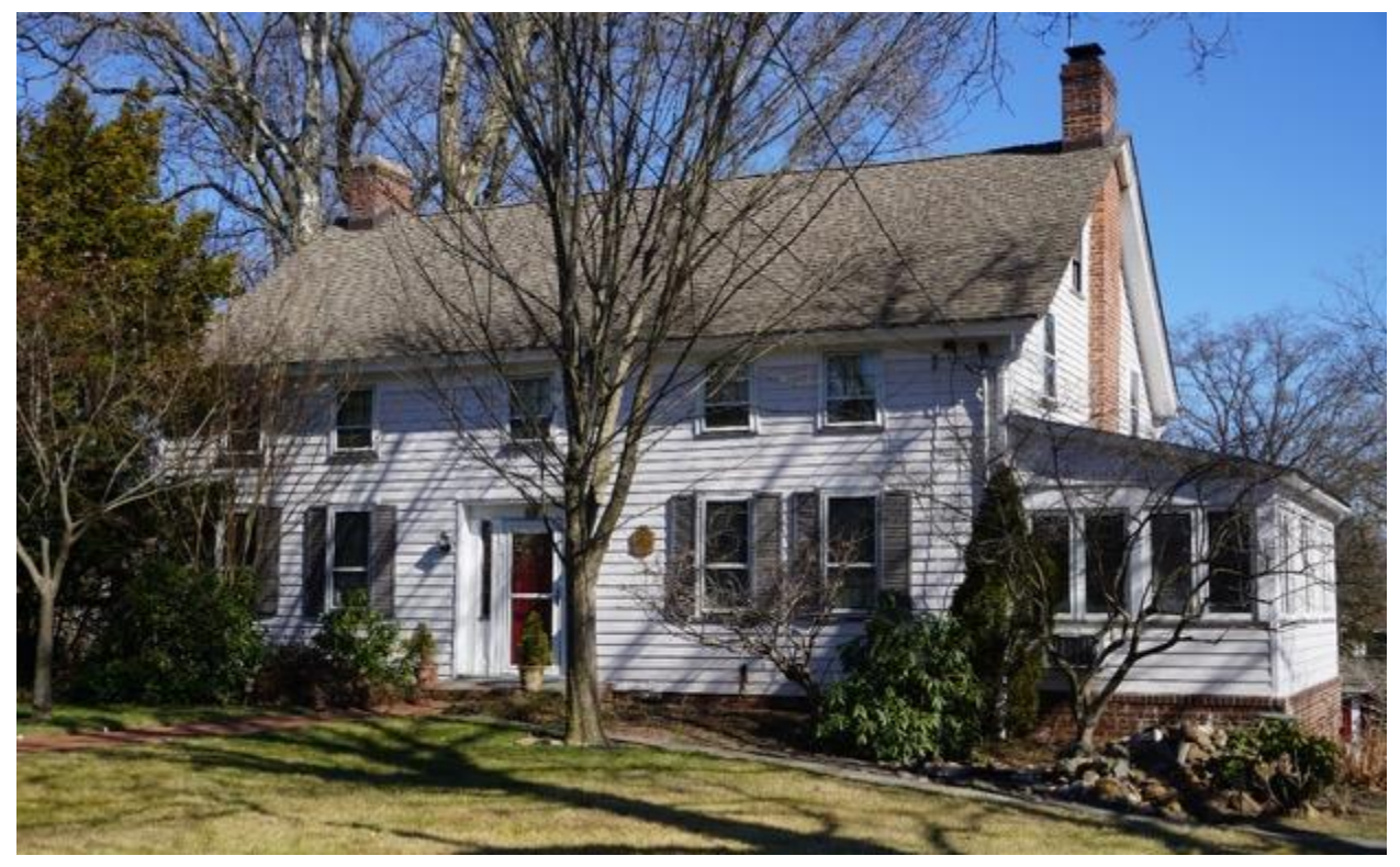
Photograph 11. Ellis Daniels House at 28 Homer Place