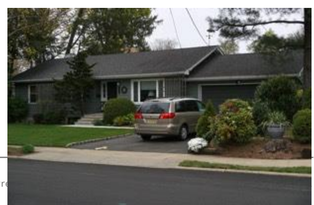
Photograph 29 Example of Ranch style