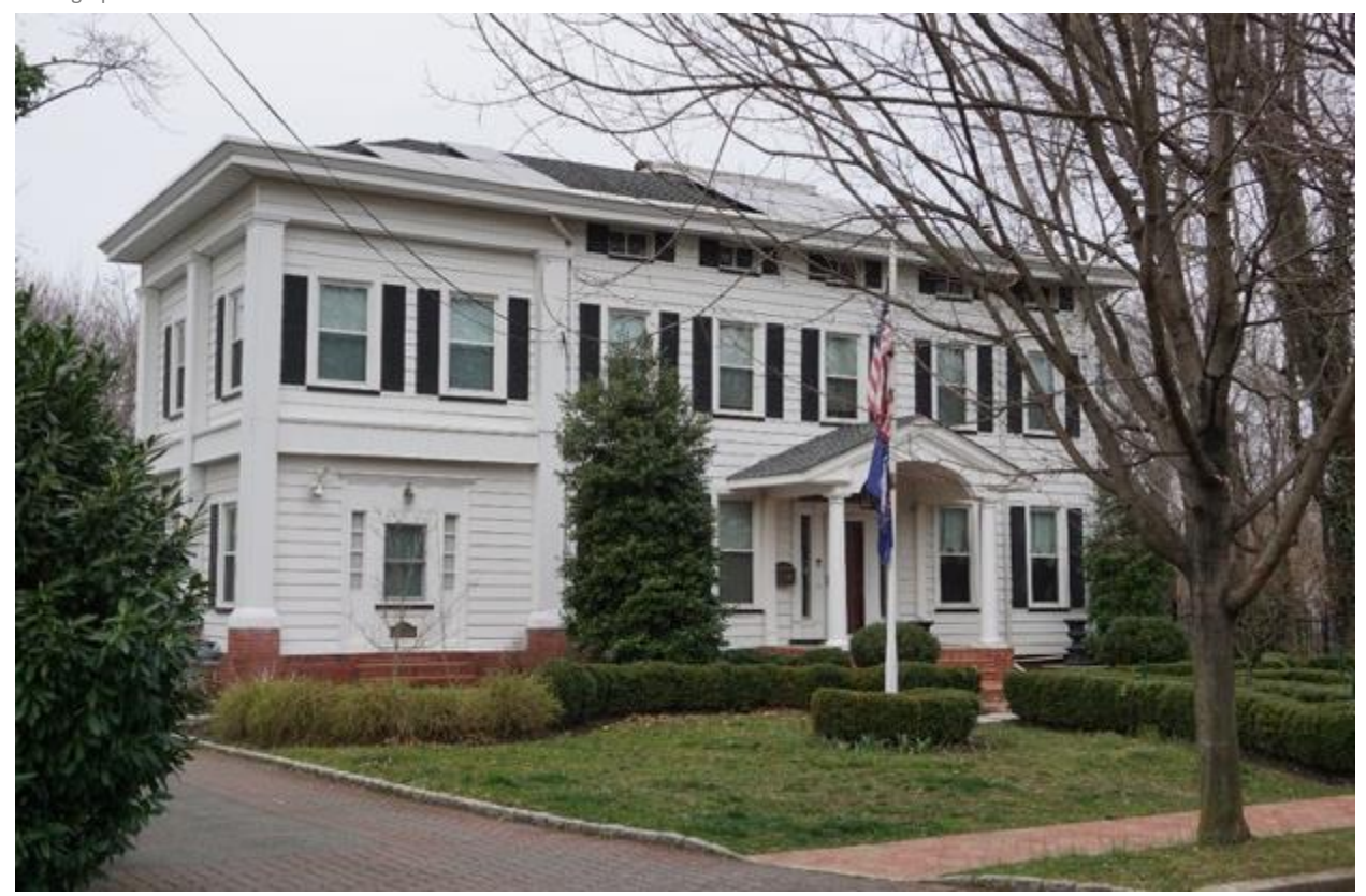
Photograph 12. Governor Silzer's House at 79 Graham Avenue