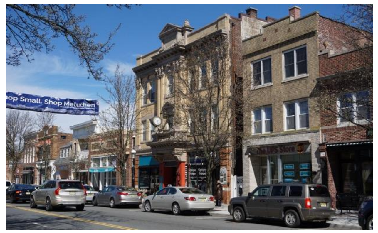
Photograph 27. Example of Neoclassical Revival style