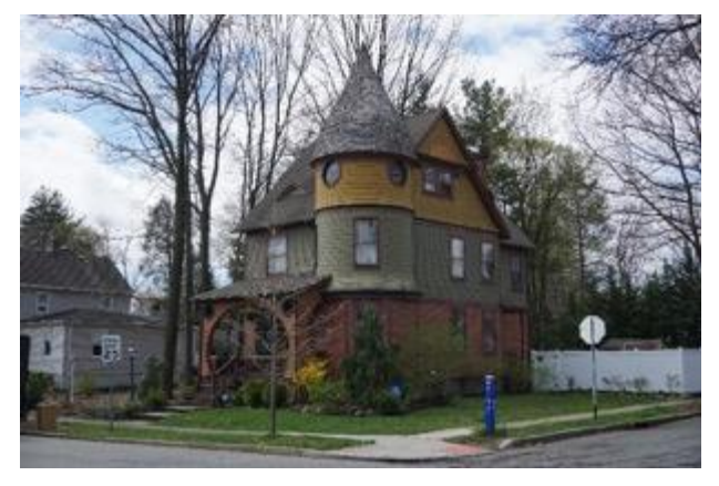
Photograph 17. Example of Queen Anne style

Photograph 16. Example of Second Empire style