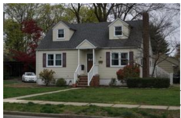
Photograph 28. Example of Cape Cod style

This post-1970s period of development also incorporates the industrial areas in the western parts of Metuchen, especially those closest to the Peter J. Barnes III Wildlife Preserve and extending along the railroad corridor to Central Avenue. Another industrial area developed along Middlesex Avenue closer to I-287. Architecturally, these industrial buildings often reflect the single-story "big box" plan behind modern industrial and commercial plant layout, where the idea is to maximize flexible indoor space. Outwardly, the buildings usually have relatively blank, nearly windowless brick or concrete-block walls.