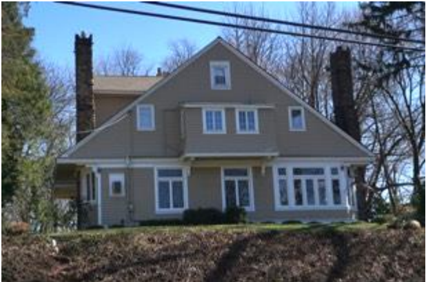
Photograph 18. Example of Shingle style