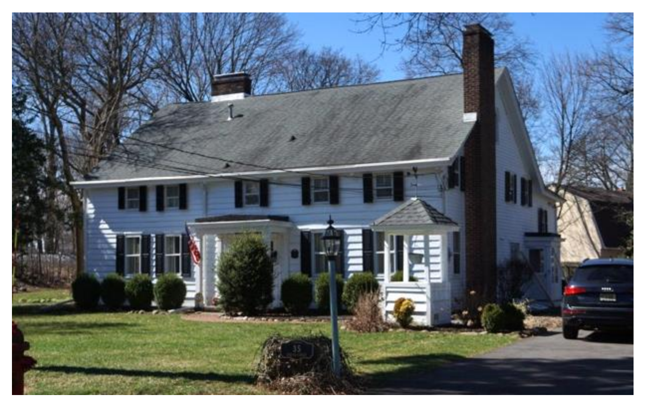
Photograph 10: Ross House at 35 Hofer Court