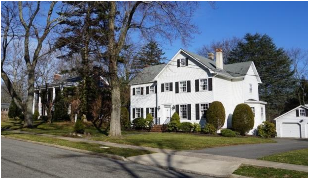
Photograph 33. Representative imagery of Clive Street – Plainfield Avenue area

Considered part of Neighborhood 1 on the 1956 planning map (see Figure 1), this small cluster of older homes in close proximity to the Port Reading Railroad line contains the eighteenth-century house at 35 Hofer Court and several Victorian-era houses, including 6 Plainfield Avenue and 36 and 76 Clive Street. These houses were all identified as individually significant in either the 1975 survey or the 1979/1985 survey, and warrant consideration either as individual resources or as a small historic district as recommended in Metuchen's 2010 historic district study.