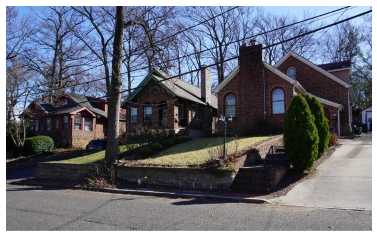
Photograph 24. Examples of Bungalow style