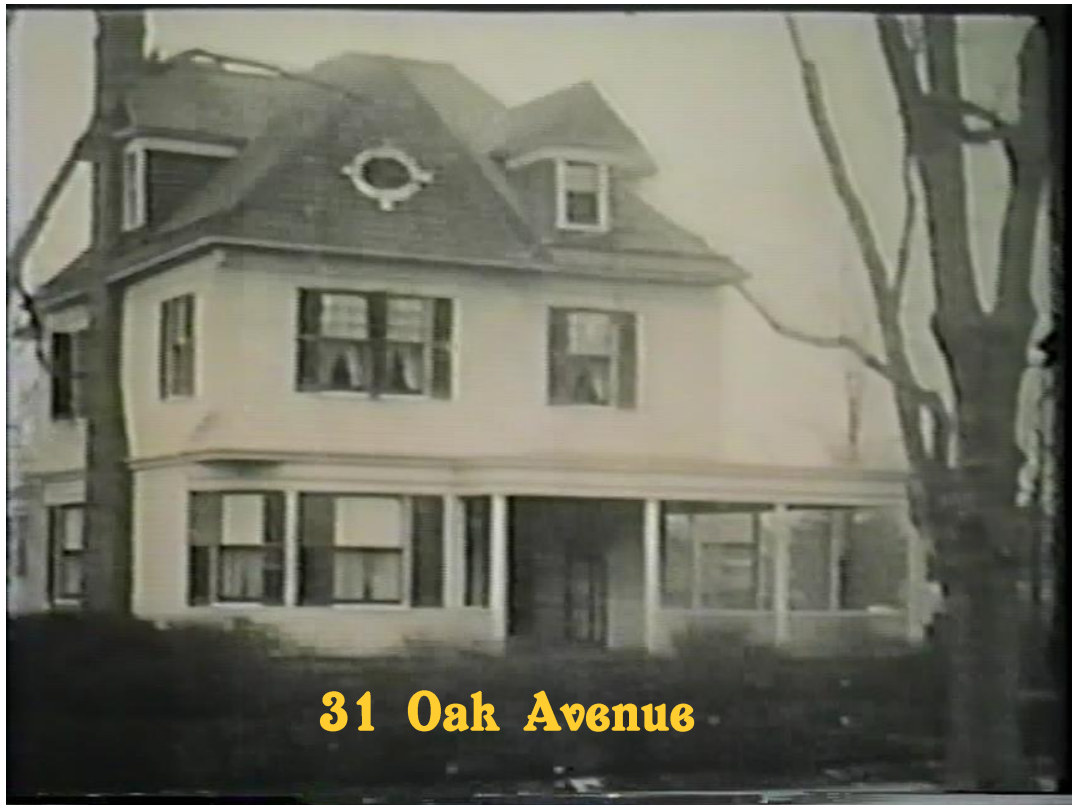
31 Oak Avenue