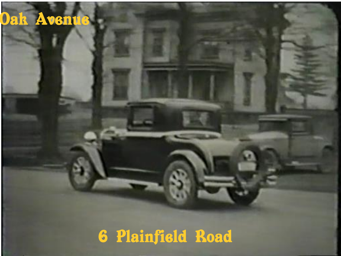
6 Plainfield Road